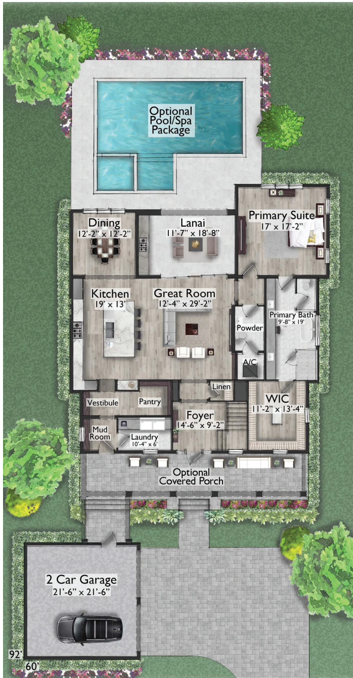
STANDARD FIRST FLOOR