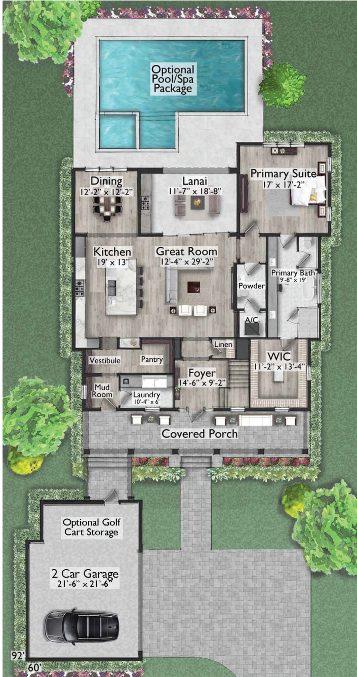
STANDARD FIRST FLOOR