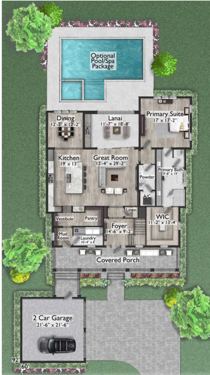
FIRST FLOOR (2,133 SF)